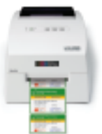
LX400 Label Printer Wristbands, Tags, Labels and Tickets