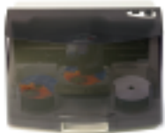
BravoPro CD/DVD Publisher Automated Disc Publishing 100-Discs