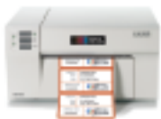
LX810 Label Printer Medical Labeling